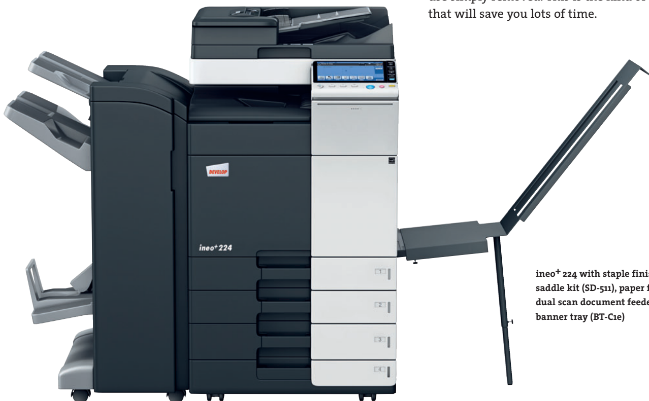
ineo+ 224 with staple finisher (FS-534), saddle kit (SD-511), paper feeder (PC-210), dual scan document feeder (DF-701), banner tray (BT-C1e)

Many multifunctional office systems are anything but user-friendly. The ineo+ 224, in contrast, is simplicity itself. An intuitive, easily understandable operating concept ensures that it is as easy to use as your smartphone or tablet. The 9-inch capacitive touchscreen comes with well-known functions such as flick&drag, and thanks to a new menu navigation structure you can see all functions in one go and select the settings you want with just a few clicks. Frequently used functions can be left on the start screen and ones you don't use simply removed. This is the kind of customisation that will save you lots of time.